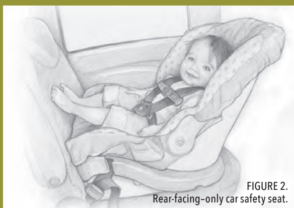
FIGURE 2. Rear-facing-only car safety seat.