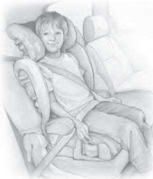
FIGURE 5. Belt-positioning booster seat.